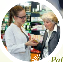
Patient & Family