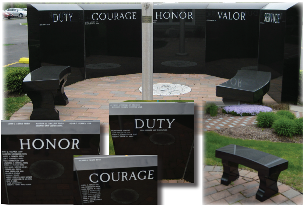
Polished Granite Bench

For more information, contact the Events Department at (716) 280-0780 or info@NiagaraHospice.org .