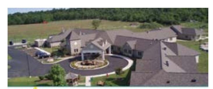
HOSPICE Our Family, Focused on Yours | Serving Niegera County Since 1988