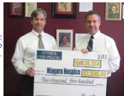
Advance Chiropractic donated $2,500 to Niagara Hospice.